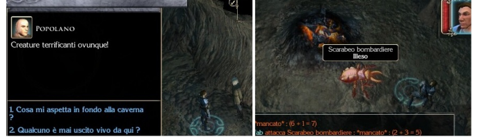
Fig. 1. The tasks “text dialogue” and “single fight” in the boredom game level.

Guideline 2: Given n textures t \in T = \{t_1, t_2, \dots, t_n\} in a game level L , then L becomes less interesting if contains less elements of T so that L = \{t_k, \dots, t_m\} \subset T, m < n ;