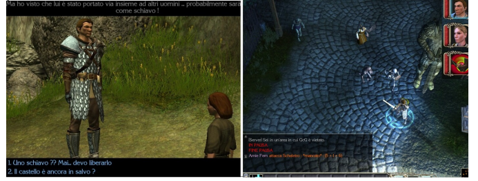
Fig. 2. The tasks “animated dialogue” and “group fight” in the flow game level.

Guideline 7: Given n generic dialogues d \in D = \{d_1, d_2, \dots, d_n\} that a player can have with the NPCs of the game level L , has to be L = \{d_k, \dots, d_m\} \subseteq D ; given also n questions q \in Q = \{q_1, q_2, \dots, q_n\} that the player can choose