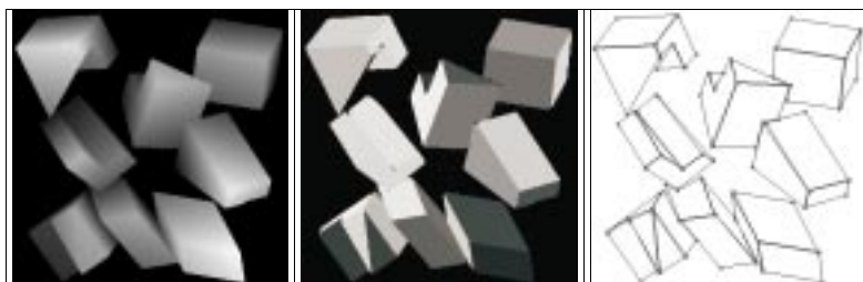
Figure 5: The block7 image

The time spent for extracting all surfaces may result too heavy in many robotic or industrial applications: for example Figure 5 represents a 3D scene with several partially overlapped objects; the problem is to find an object that satisfies the defined model (the L-shaped of Figure 1, i.e. the block in the middle-left part of the image). The first frame of Figure 5 shows the original image, the second frame the segmented image where all surfaces are segmented and the third the extracted information on edges and corners in order to check adjacency and geometric constraints. These operations take some minutes on standard workstations.